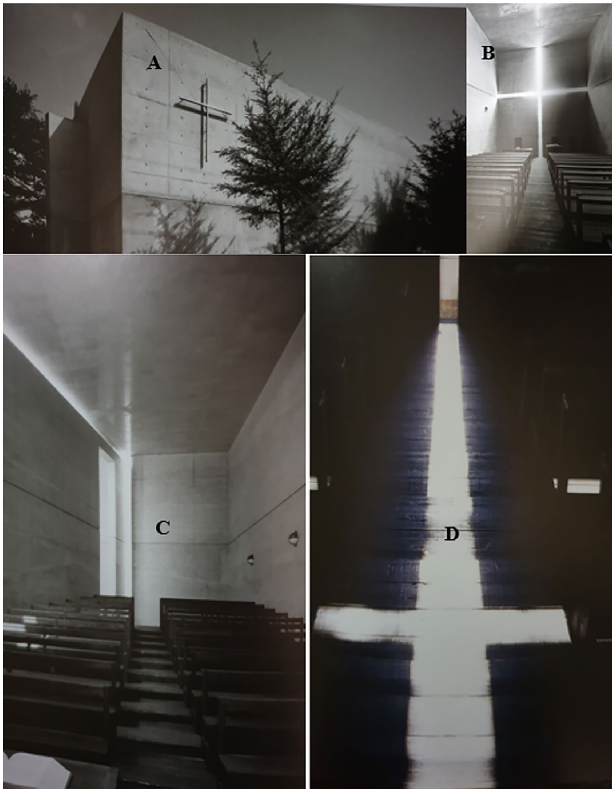
Fig. 4 Church of the Light, Irabaki, Osaka, Japan ( Source: Tadao Ando: Complete Works 1975–2012 (Jodidio 2012 ))