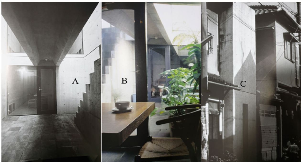
Fig. 2 Row House Sumiyoshi, Osaka, Japan

influenced by philosophers Lau Tzu and Confucius, so his work produced a contradiction between Western cultural philosophy. These two philosophers very much change Kurokawa's mindset. Kisho Kurokawa's philosophy differed from the Western ideas of determinism and inevitability. His concept of Metabolism is nothing but a manifestation of a sense of timeliness. In the Nakagin Capsule apartment building, Kisho Kurokawa considers that the capsule apartment is not one part, but rather a component that is similar to a living cell, meaning that it has its life cycle as a unit of space. So, the advantages of the Nakagin Capsule apartment in Kisho Kurokawa's work are known among contemporary Japanese architects (Kurokawa 1994b). Along with the development of time with Kisho Kurokawa, he also developed and refined, we are developing and refining the concept of metabolism with the concept of symbiosis. The philosophy of this symbiosis is also rooted in Buddhist philosophical thinking and traditional Japanese culture, influenced by the philosophy of Lau Tzu and Confucius. This symbiosis philosophy is concerned with human and nature, past and present, parts and whole, art and science, cultural differences, economics, and present culture (Kurokawa 1994b).