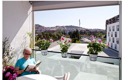
Fig. 5 GRND82's project in Can Travi: general view of the residential block over the cultural plinth and detail from a private terrace

memory". 19 A first definition of this concept came soon after, in article 3, where vivienda dotacional pública is identified as "public housing intended to meet the temporary needs of people with emancipation difficulties or who require shelters or residential assistance, such as young people, the elderly, women victims of genderbased violence, immigrants, separated or divorced people who have lost the right to the use of shared housing, people pending rehousing due to public housing replacement operations or urban planning enforcement actions, or the homeless". This housing model was specially thought for short-term stays of people who do not necessarily share family ties but need temporal accompaniment to ensure their social integration. However, the innovative character of the viviendas dotacionales públicas concept is fully developed in article 18 of the law by pointing out that these subsidised homes can be located on land that is classified as public equipment or facilities, fully integrated with them in the same project and/or building.<sup>21</sup> This opened up a great opportunity not only to fight against social housing shortage, but also to create a more diverse urban fabric in functional and social terms.