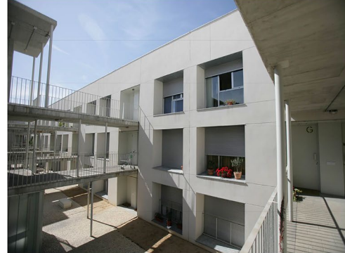
Fig. 8 Alberola and Martorell's project in Carabanchel: plan of housing units with the kitchen area and courtyard at their center and view of the external walkways

a first interesting case of interaction can be retraced between 2004–2005. The Basque Country, which has been particularly precocious in confronting the gender issue, approved in 2005 Ley 4/2005 , the " Basque Law for Equality ", focusing on the gender perspective in its articles 18 "Measures to promote equality in regulations and administrative activity. General provisions"<sup>37</sup> and 46 "Environment, spatial planning, urban planning, housing, transport, and rural areas."<sup>38</sup>