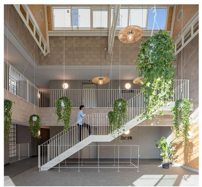
Fig. 3 TAAs' social housing in Carabanchel views of a so-called "social condenser" and general floor plan showing the building's relation to cool nocturnal winds (© Javier y Alia García-Germán and ©TAAs totem arquitectos asociados)

voids can be excluded from the gross floor areas. By doing so, they found a new role for exterior space in urban collective housing.