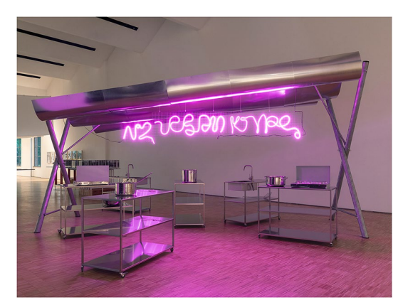
Fig. 9 Reconceptualizing the kitchen by MAIO: Urban k-type at Triennale Milano (© MAIO, Simone Marcolin, Paula Fernández, photo: ©Simone Marcolin)

transversal permeability and use flexibility (Fig. 10). In particular, the kitchen, recalling Carabanchel's project, is located at the very centre of the house, embodying not only the place to develop the cooking activity but also the place to stay and chill, fully integrated with the rest of the house.