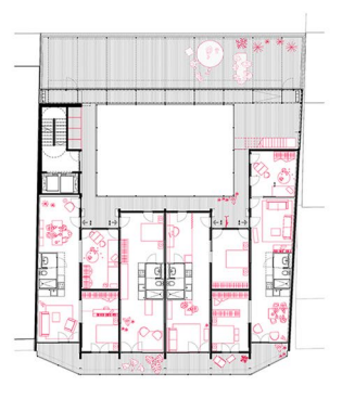
Fig. 7 La Borda Cooperative, collective space at first level, view of the living and kitchen area within a housing unit, and floor plan with common rooftop (© Lacol)

from the corridors, that can be used independently from the rest of the house, even by other members of the cooperative, an innovative feature derived from Xavier Monteys' "satellite room" concept. Significantly, within the housing unit itself, the kitchen is located at the very baricentrum, a key tendency against the stereotyped treatment of service spaces that will be further developed in the next section of this paper. For sure, Lacol listened to the inhabitant's needs, but a great part of their typological innovations are also derived from a long tradition of architectural and urban academic research that has been carried out by the above-mentioned Xavier Monteys and his Habitar research group from the Universitat Politècnica de Catalunya since the beginning of the 2000s.