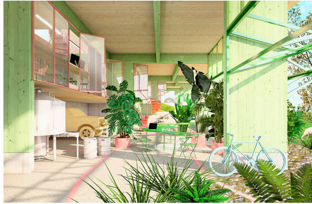
Fig. 11 Europan 16, Rhizoma: masterplan and view of productive spaces (© Gonzalo Peña (KRI), Jon Garbizu y Victoria Collar (Garbizu Collar Architects)