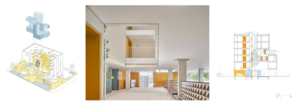
Fig. 4 Ripoll and Tizón's project in Ibiza: 'in-between' collective spaces (© drawings: ripolltizon)

Madrid's cases. In fact, this project can only be understood through its strict connection with the Baleares' climate, which requires controlled openings with solar protections, porches, and shaded spaces. Moreover, its design strategy aligns with the local architectural tradition based on accretive strategies, allowing for the addition of new modules and spaces over time. Different housing typologies have thus been included within the complex through the dissemination of small additional modules containing bedrooms and wet areas. The resulting system is articulated around a central void: the interior common space which breathes in several directions through connected openings, patios, and porches, while also organising the areas for community use, from circulation and access to dwellings to other common spaces. This irregular volume, which changes its conformation on each floor, gives shape to an interconnected landscape in which inhabitants can share their time with others, meeting either in the big spaces of the ground floor or in the capillary inter-spaces constituted by corridors and covered walkways, not to forget the possibility of observing and interacting with everyday scenes taking place right beyond their private terrace.