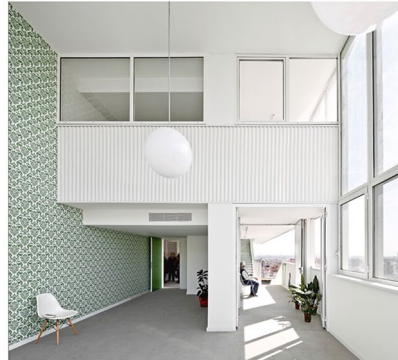
Fig. 6 Torre Julia, mixing residential programs and public services in Barcelona

The success of the 2007 law is not only endorsed by further development of the viviendas dotacionales concept in subsequent regional decrees (Decreto 75/2014 and Decreto-ley 17/2019)<sup>22</sup> but, more interestingly, by the fact that it has spread throughout the country, starting with the already-mentioned Ley 5/2018 <sup>23</sup> in the Balearic Islands and most recently, at a national level, with the "Right to Housing" Law 12/2023 . Both cases confirm again the symbiotic potential of combining rental housing for vulnerable communities and public facilities in the same plot.